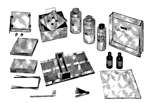
Camag Model 12B TLC Starter Kit